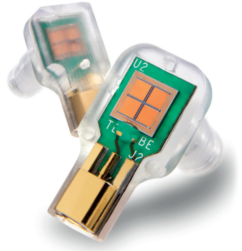
MEMS loudspeaker mounted in in-ear housing